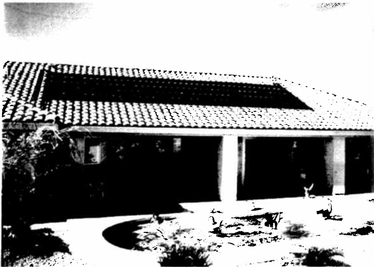
A one time installation provides decades of enjoyable, warm pool water.

The best news of all... Suntrek is very affordable